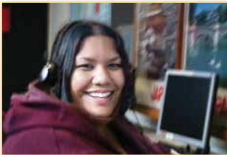
Designated gifts to the Language Program purchased new headphones for the language laboratory.

The Annual Fund campaign is underway! Gifts from alumni and friends, faculty and staff, business partners, parents and grandparents are transforming the campus. Your gifts enable technology upgrades in the classrooms, new lab equipment, emergency financial aid, and unique learning experiences for students. Please support the Annual Fund by responding to your mailed appeal or by visiting www.berkshirecc.edu/donatingonline .