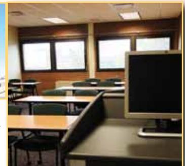
Unrestricted gifts to the Annual Fund furnished our new classrooms in the Silvio O. Conte Federal Building.