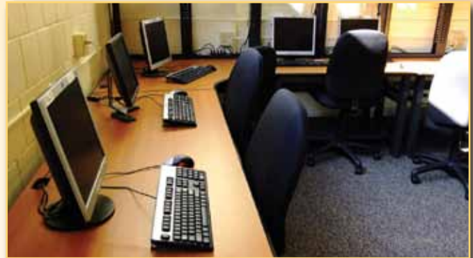
Unrestricted gifts to the BCC Foundation were paired with designated grants to refurbish Melville Hall, Room 208 (above) and Room 236.